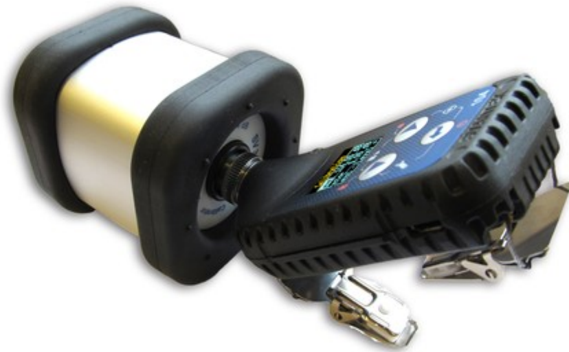
Picture 2. Calibration of the personal exposure meter with a ½" measurement microphone

The SV 34A is designed for calibration of sound level meters with ½" microphones. Picture 2 shows the way of insertion of a ½" microphone into calibrator.