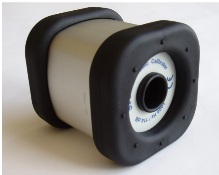
Picture 1. Acoustic calibrator SV 34A

Due to the feedback regulation loop the SV 34A calibrator does not require adjusting and operates in a wide range of temperatures and humidity (see SV 34A Datasheet).