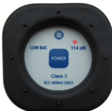
Picture 4. The top view of the SV 34A calibrator with one diode on