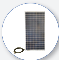
SB 271 Solar Panel to Monitoring Station