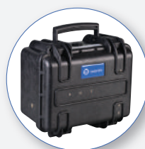
SB 272 External 33 Ah Battery to Monitoring Station