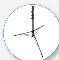
SA 206 Mast for Microphone Protection Kit