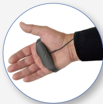
SV 105F Tri-Axial Hand-Arm Vibration Accelerometer with Force Detection