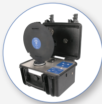
SV 111 Hand-Arm and Whole-Body Vibration Calibrator