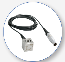
SV 151 Tri-Axial SEAT Vibration Accelerometer