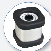
SV36 Class 1 Acoustic Calibrator 94 dB / 114 dB at 1 kHz