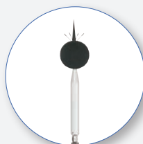
SA271 Microphone Outdoor Protection Kit