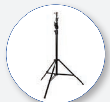
SA420B Tripod Up To 4 m Height