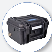
SM271 LITE Outdoor Monitoring Case