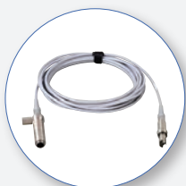
SC91 Microphone Extension Cable